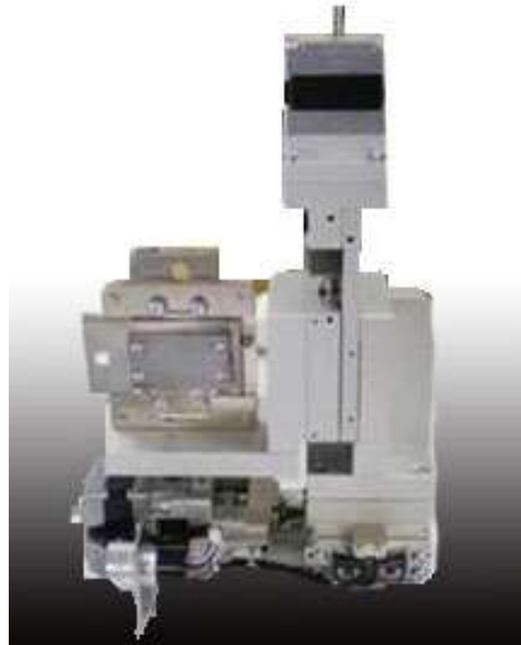
< The special 0.005 mm slit >