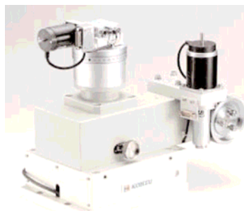
<KTG-15DAP (1/200 gear reduction type)>

Kohzu's KTG-15 goniometers were specifically developed for use at high energy X-ray synchrotron facilities where precision angular displacement and repeatability are essential. The goniometer's extreme resolution is attained by displacing a rotation spindle fitted with a long radially mounted arm, via a tangentially positioned and motorized micrometer head.